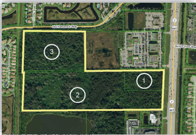
Figure 2: Parcel Designation

Parcels 2 and 3 have no prior approvals, however in 1984 parcel 3 was subject to a special exception use approval to