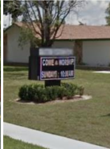
Multi-Panel Monument Sign: