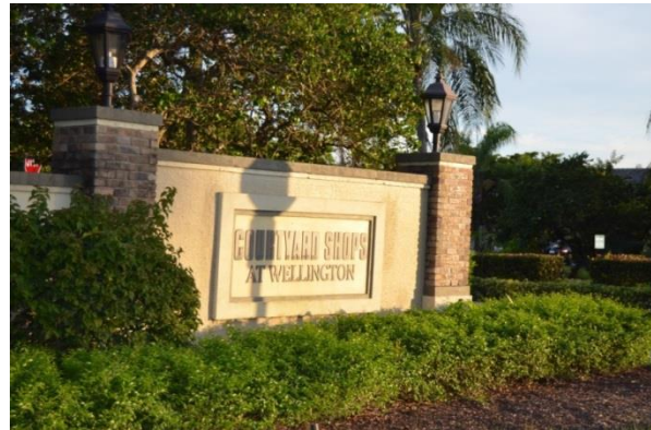
Auxiliary Wall Sign: