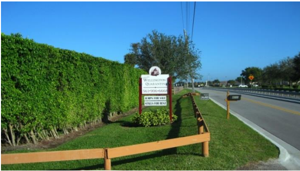
Incidental Ground Sign: