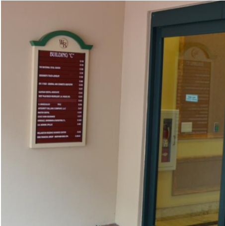
Incidental Wall Sign: