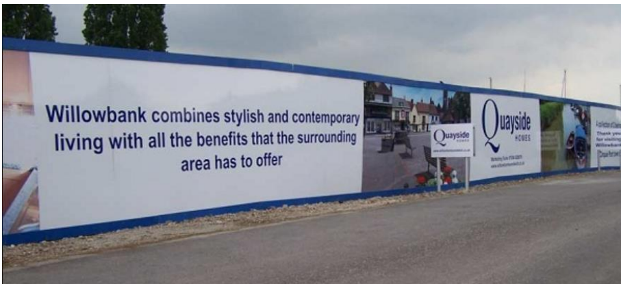
Fence Banner Sign: