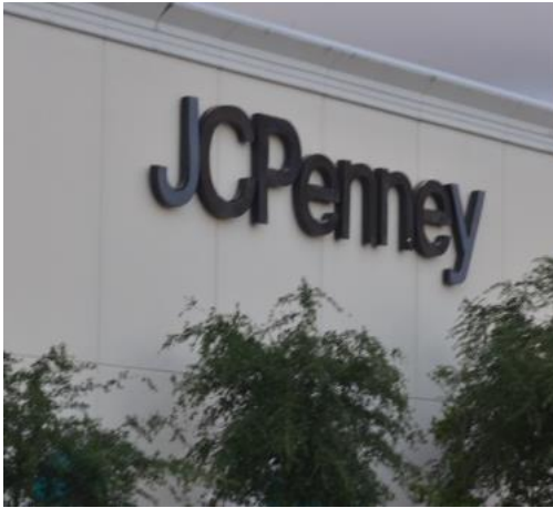
Major/Minor Principal Wall Sign: