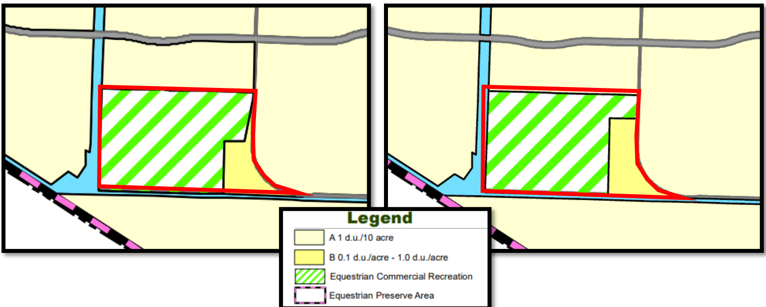
Proposed Future Land Use Map