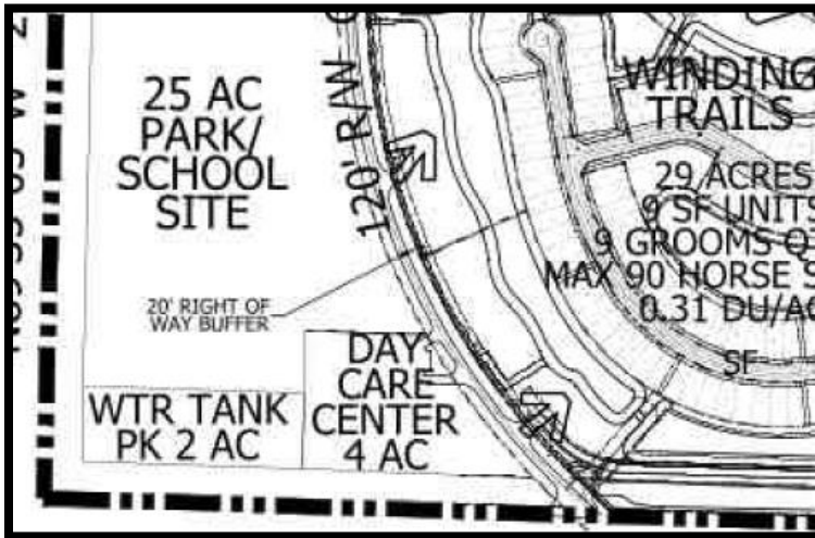
Existing Master Plan