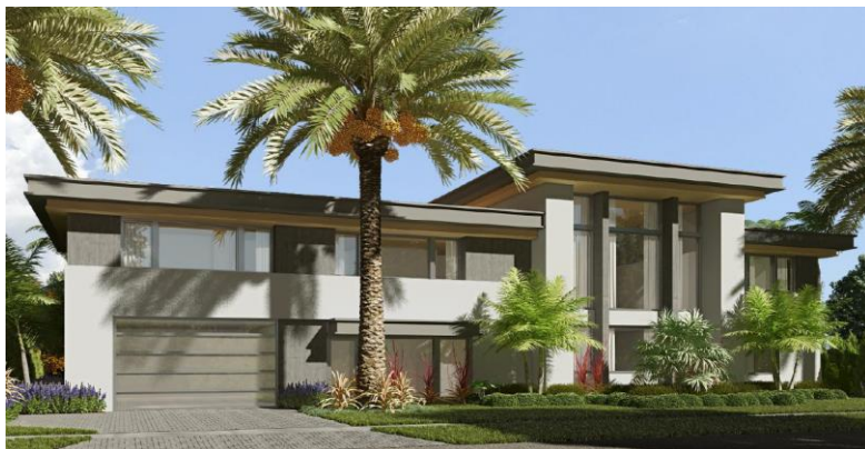
Lot 21 (Model 3) – Proposed

Model 3 was approved in August 2023 and is currently under construction. The applicant is requesting a reduction in the amount of wood within the front elevation and introducing a charcoal gray accent feature. The wood elements will be maintained within the eaves. No other changes are being requested.