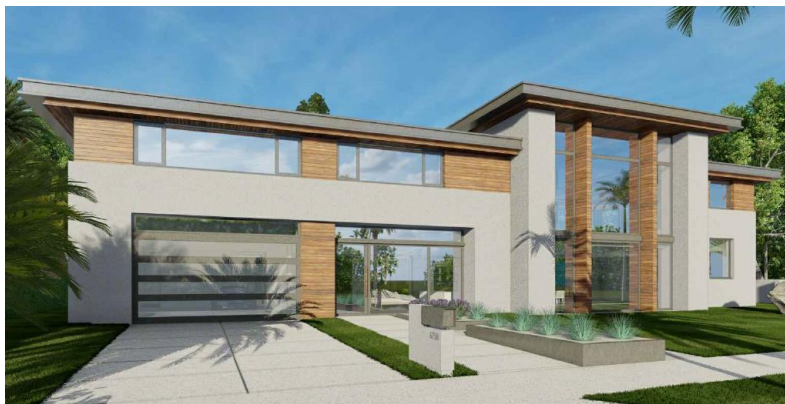
Lot 21 (Model 3) – Approved 8/2023