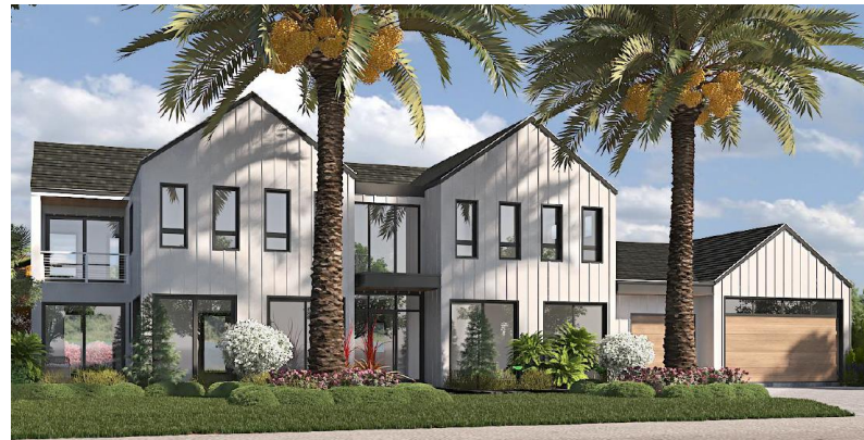
Lot 1 (Model 7) - Proposed

Model 7 was approved in January 2024 and is currently under construction. The applicant is requesting to simplify the front elevation as the previous elevation seemed too busy. No other changes are being requested.