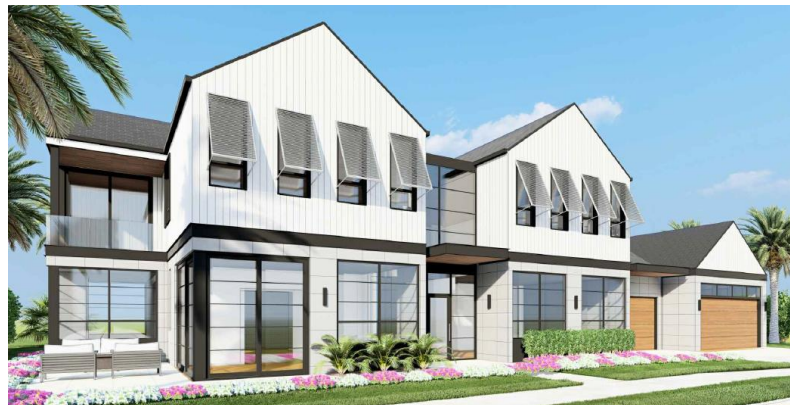
Lot 1 (Model 7) – Approved 1/2024