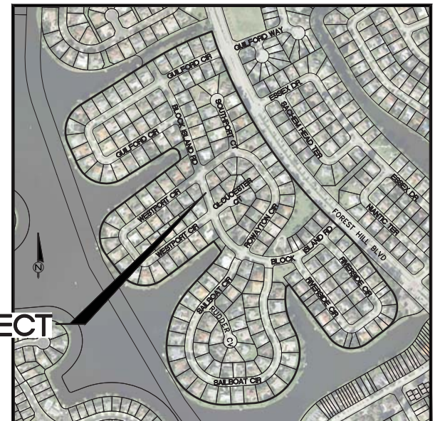
VICINITY MAP 1:300 SCALE

WILLIAM J. RIEBE, P.E. VILLAGE ENGINEER FL REGISTRATION NO. 49597