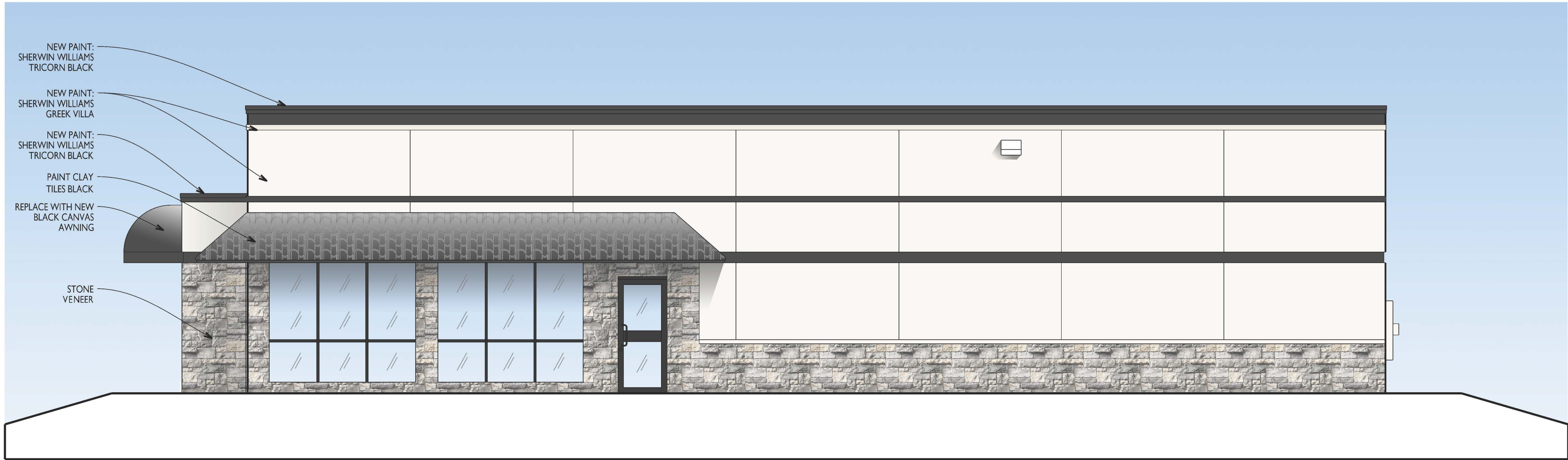
PROPOSED BUILDING ELEVATION SCALE: 1/4"=1'-0" SOUTH ELEVATION

GENERAL NOTES: ALL GENERAL & SUB-CONTRACTORS TO FIELD VERIFY ALL DIMENSIONS. ELECTRICAL, WATER, SEWER AND GAS SERVICE LOCATIONS. ALL WORK MUST COMPLY WITH THE 2017 6TH EDITION (EXPOSURE "D") OF THE FLORIDA BUILDING CODE SECT. 1609/ 163 MPH WIND LOAD AND THE FLORIDA ACCESSIBILITY CODE FOR BUILDING CONSTRUCTION ALL DOOR & WINDOW OPENINGS TO MEET OR EXCEED DESIGN PRESSURE RANGE AS SPECIFIED ON SHEET TBL THE BUILDING RISK CATEGORY IS "II" INTERNAL PRESSURE COEFFICIENT IS .18 IN ACCORDANCE WITH ASCE 7-10 ALL GLAZING IS TO BE IMPACT RESISTANT