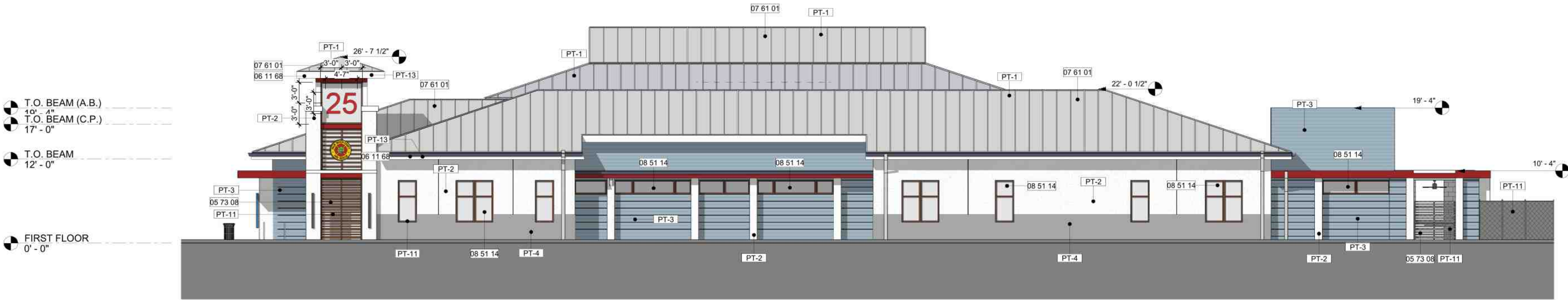
1 A3.01 SOUTHEAST ELEVATION 1/8" = 1'-0"