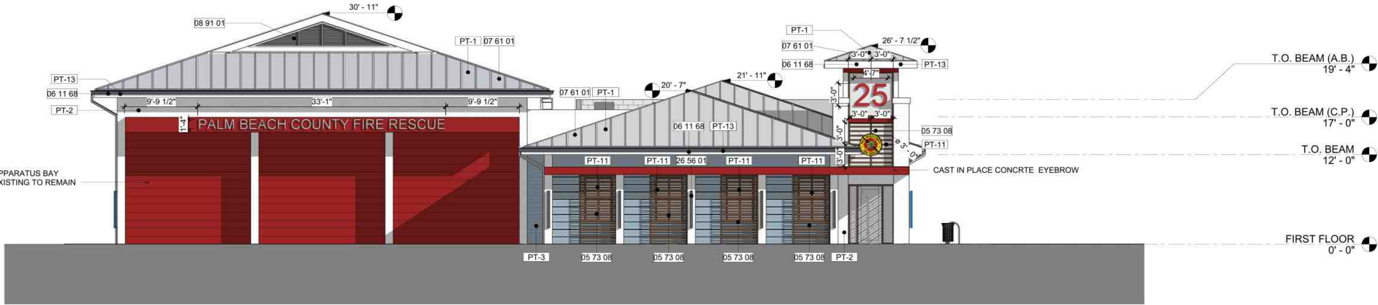
2 A3.01 SOUTHWEST ELEVATION 1/8" = 1'-0"