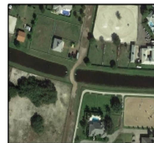
BLUE TRAIL CROSSING