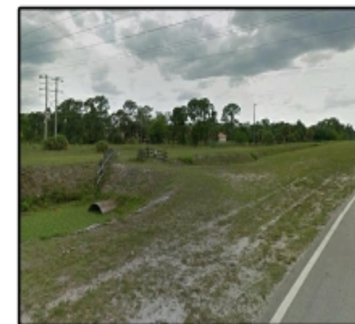
CROSSING INTO PRIVATE RESIDENCE