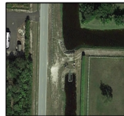
CROSSING FROM FLYING COW TRAIL TO YELLOW TRAIL

Note: Culvert size determined by Village Engineer.