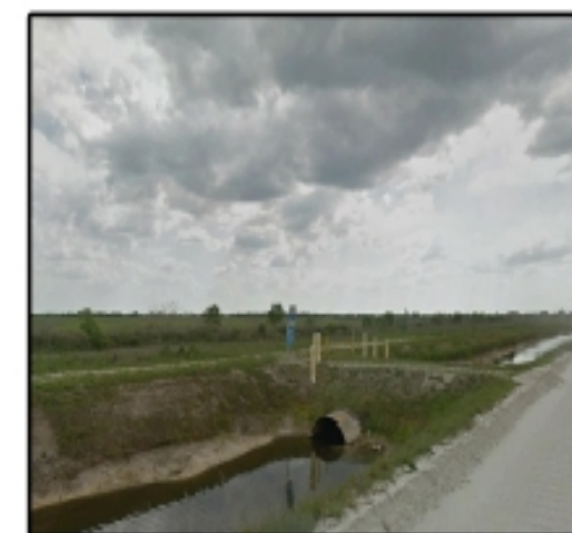
CROSSING ONTO ORANGE TRAIL