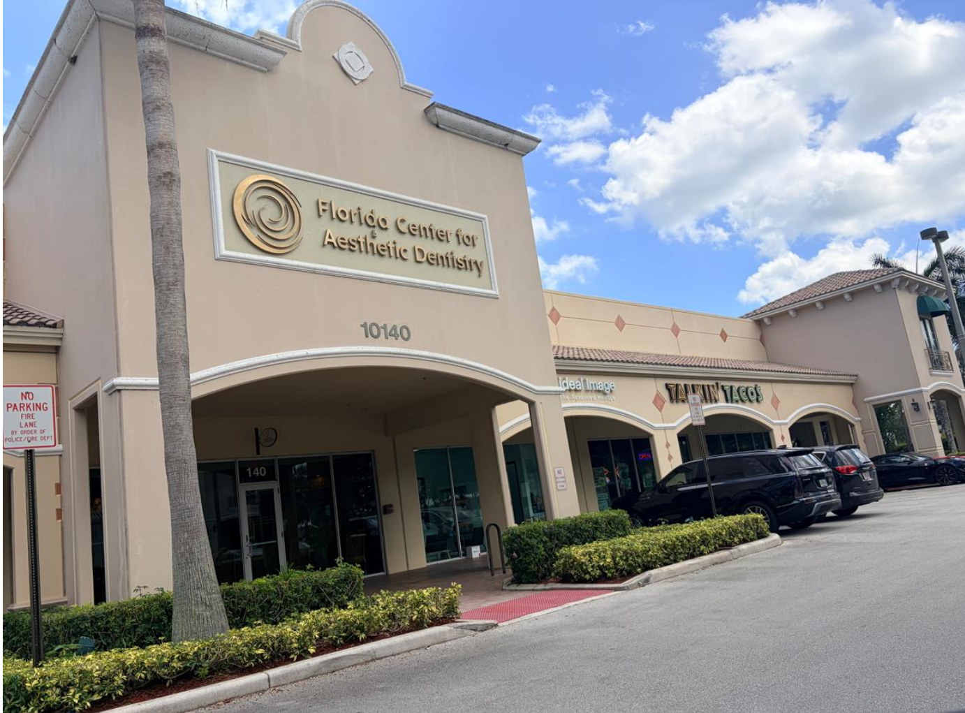
Exhibit A – Existing Site Conditions