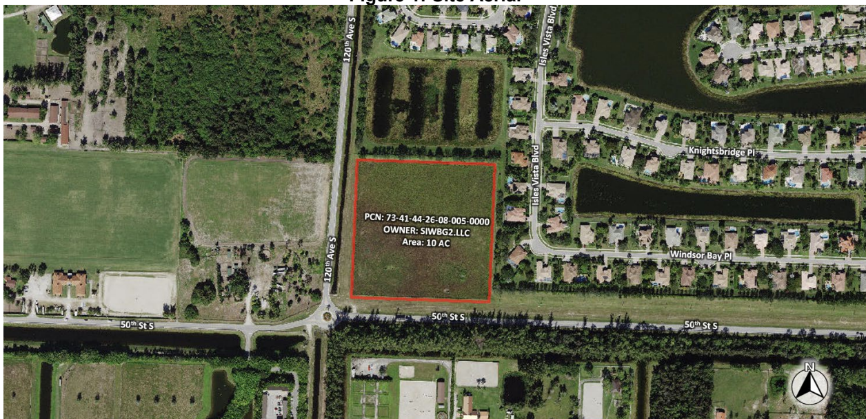
Figure 1: Site Aerial