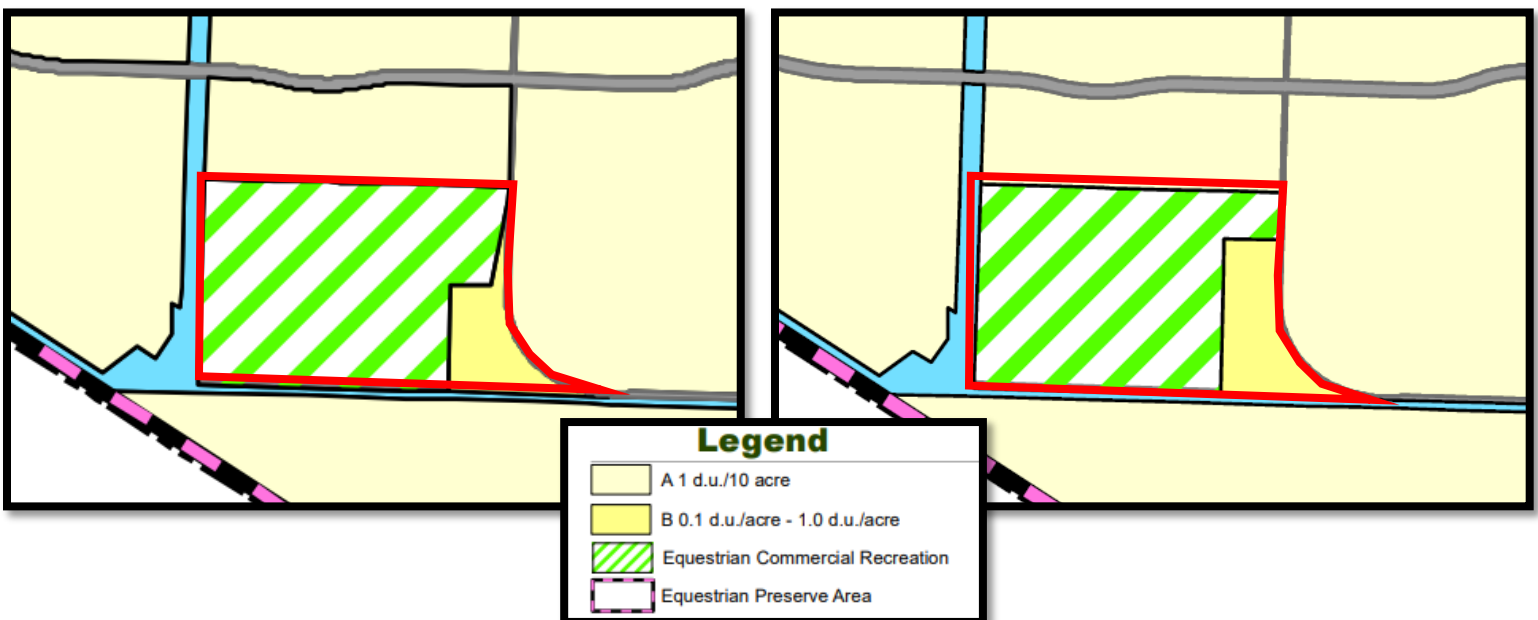
Proposed Future Land Use Map