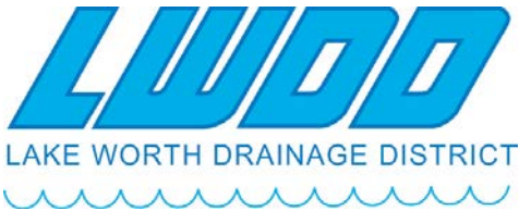
Exhibit A: LWDD No Objection Letter

13081 MILITARY TRAIL DELRAY BEACH, FLORIDA 33484-1105