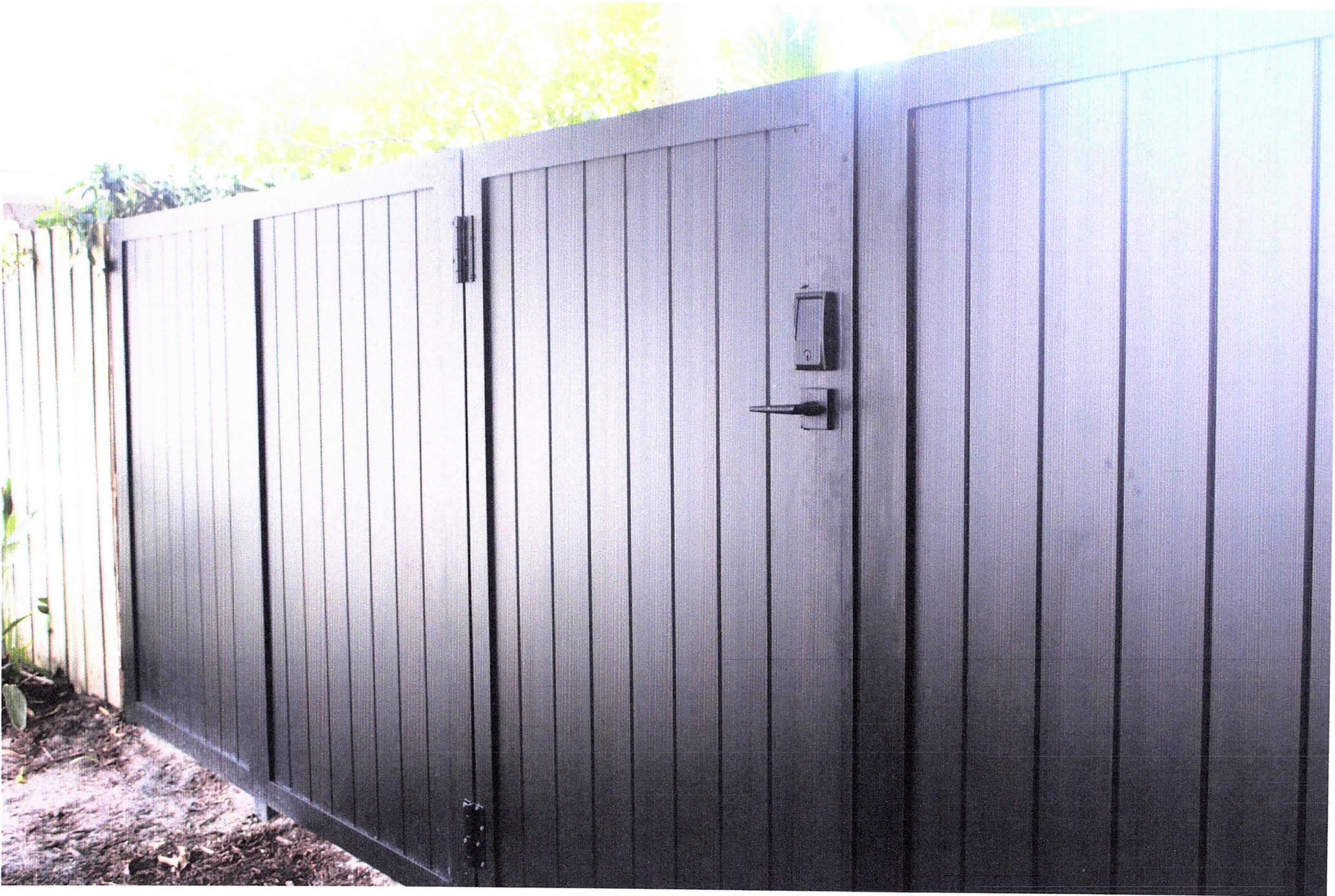
Exhibit C - Proposed Fence Design