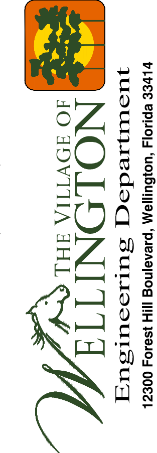
EXHIBIT FOR CULVERT 130 REPAIR POLO CLUB ROAD / C-7 CANAL

KYLE D. BURG, P.E. FLORIDA LICENSE No. 84170