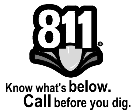
EXHIBIT 7 / 12 / 2022