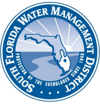
Exhibit G: SFWMD Informal Wetland Determination SOUTH FLORIDA WATER MANAGEMENT DISTRICT