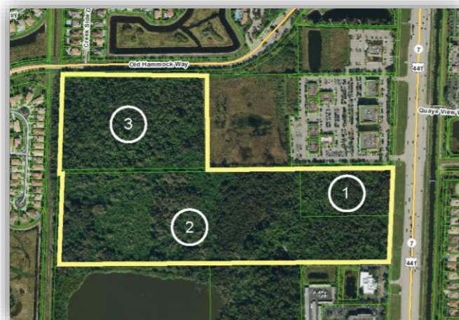
Figure 2: Parcel Designation