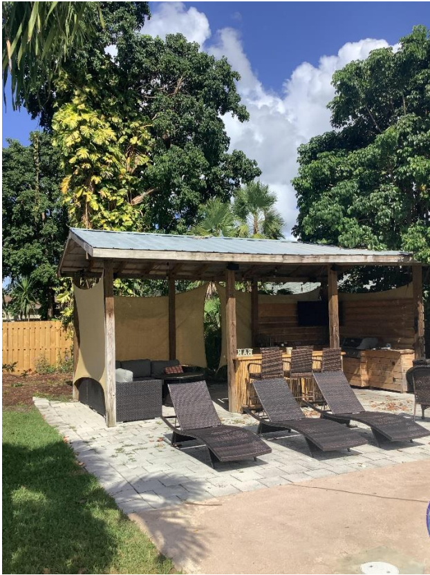
Existing structure and rear of property: