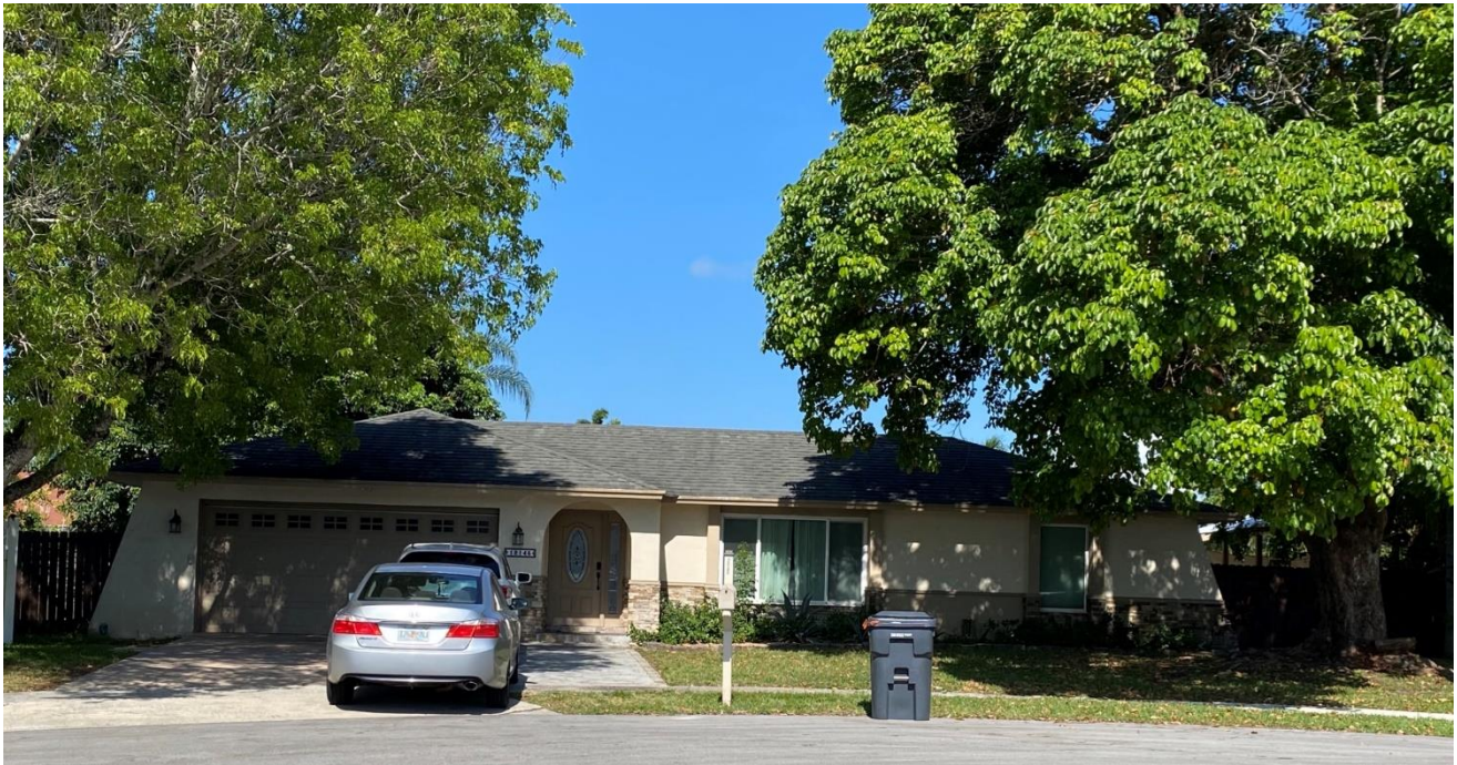
Front of property