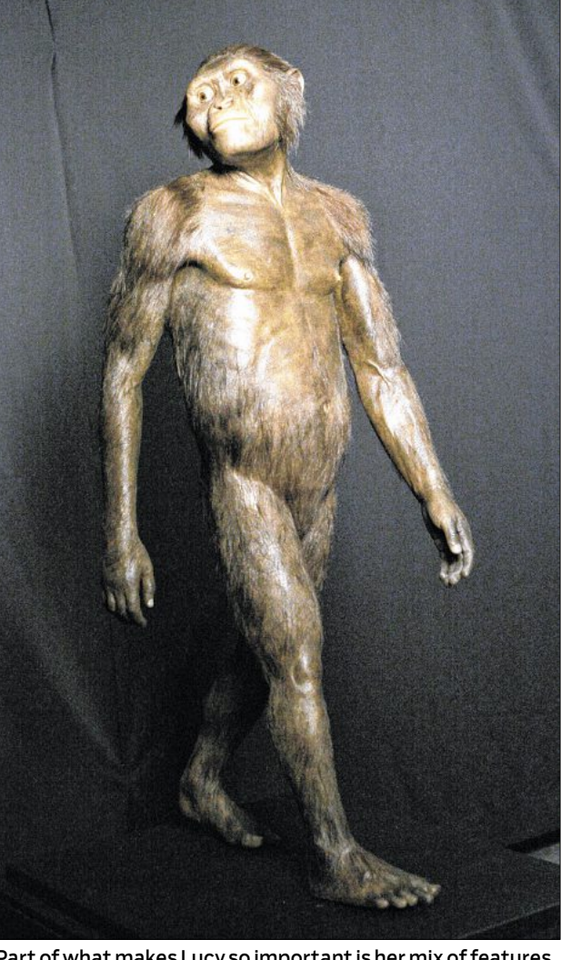
Part of what makes Lucy so important is her mix of features. She had short legs and long arms like a chimpanzee, but her wide pelvis indicates that she walked upright. The combination suggests her species may be a link between modern humans and our tree-living ancestors.

Lucy was discovered in 1974 link between modern humans