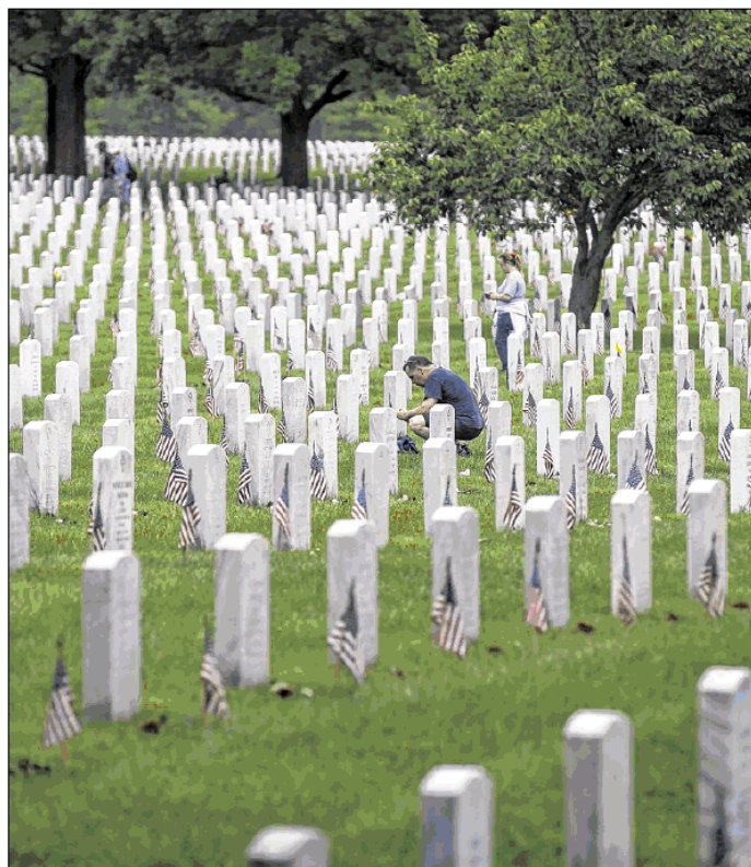
Visitors pay respects Monday in Arlington's Section 60, which contains the remains of many service members who died in Afghanistan and Iraq.

To his parents, Trump said, "We stand in awe of