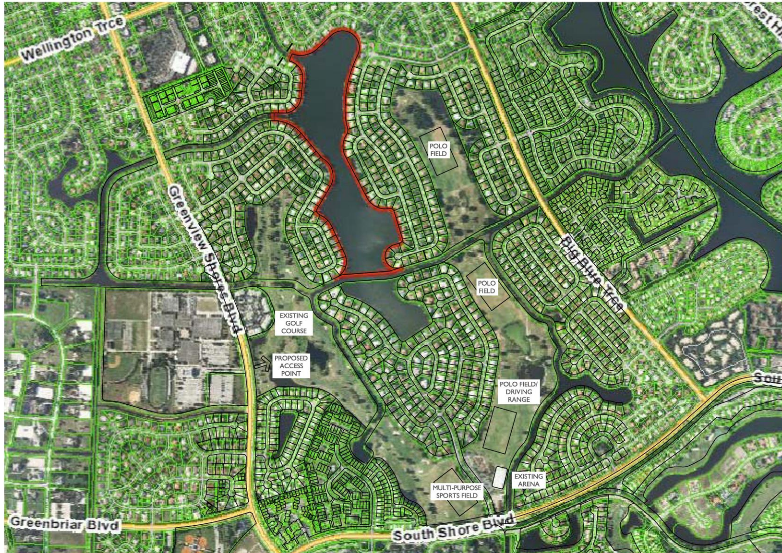
EXHIBIT C Conceptual Site Plan

WGL LAND DESIGN SERVICES DIVISION LANDSCAPE ARCHITECTURE / PLANNING / ENGINEERING / SURVEYING / EXISTING / DESIGN SERVICES 3030 Vista Parkway, West Palm Beach, FL 33411 Phone: 561.757.2222 www.wgl.com CSP No. 001-18-161-7038