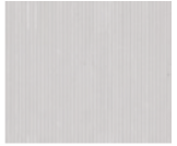
light gray seamless metal