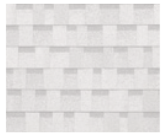
light gray roof tiles