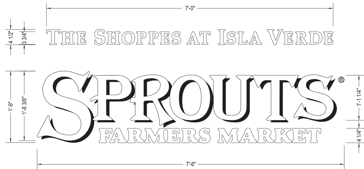
PROPOSED PLATE AND REVERSE CHANNEL LETTERS : 3/4" = 1'-0"