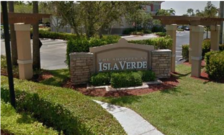
EXISTING MONUMENT SIGN FOR REFERENCE : NO SCALE