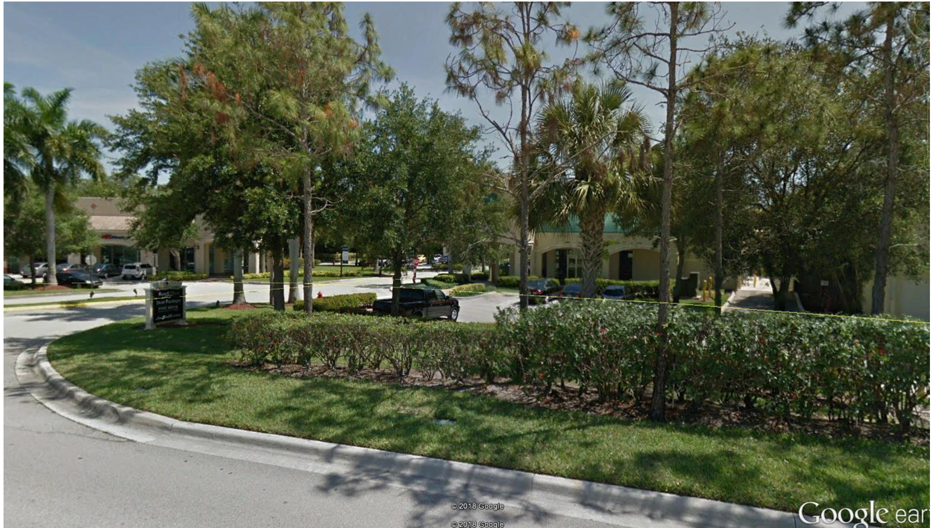
Ring Road (North Approach) – Secondary (end) elevation visible