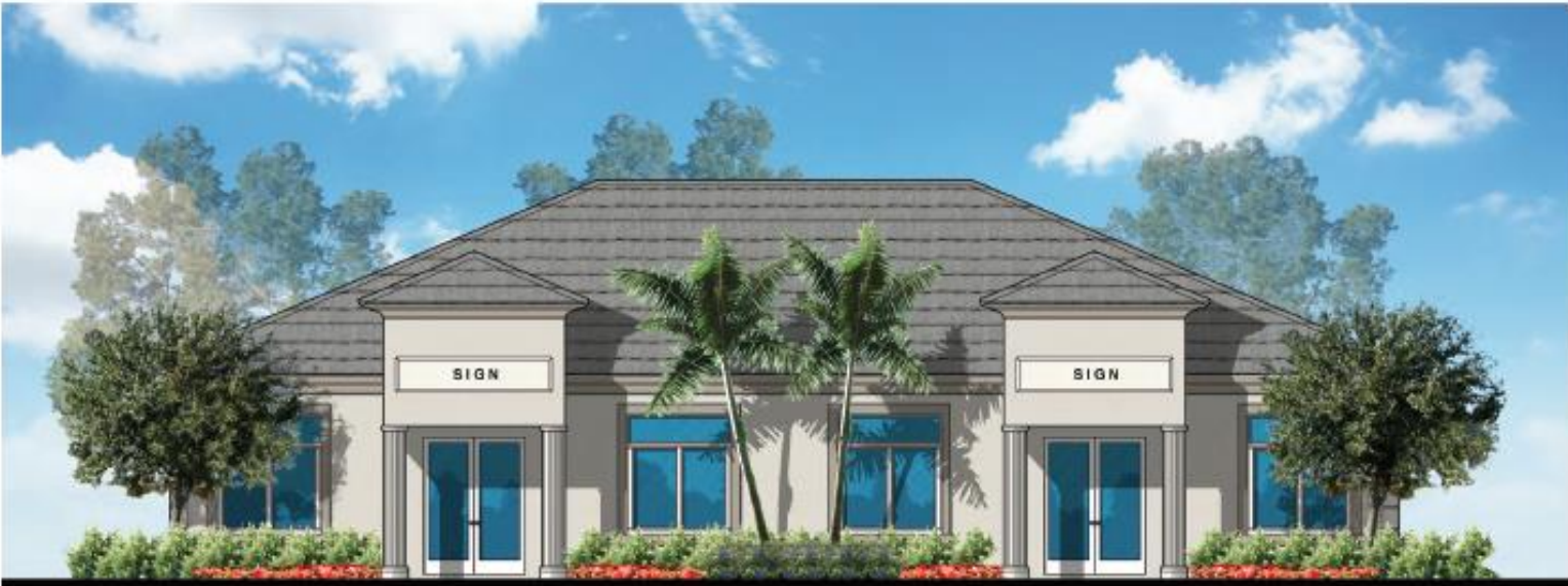
FRONT ELEVATION WITH LANDSCAPE

Lots 5, 6, 12 and 13 approved by ARB on September 20, 2018