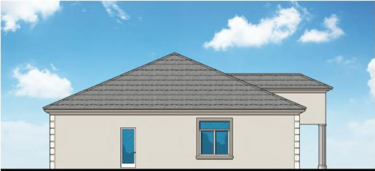
LEFT ELEVATION WITHOUT LANDSCAPE