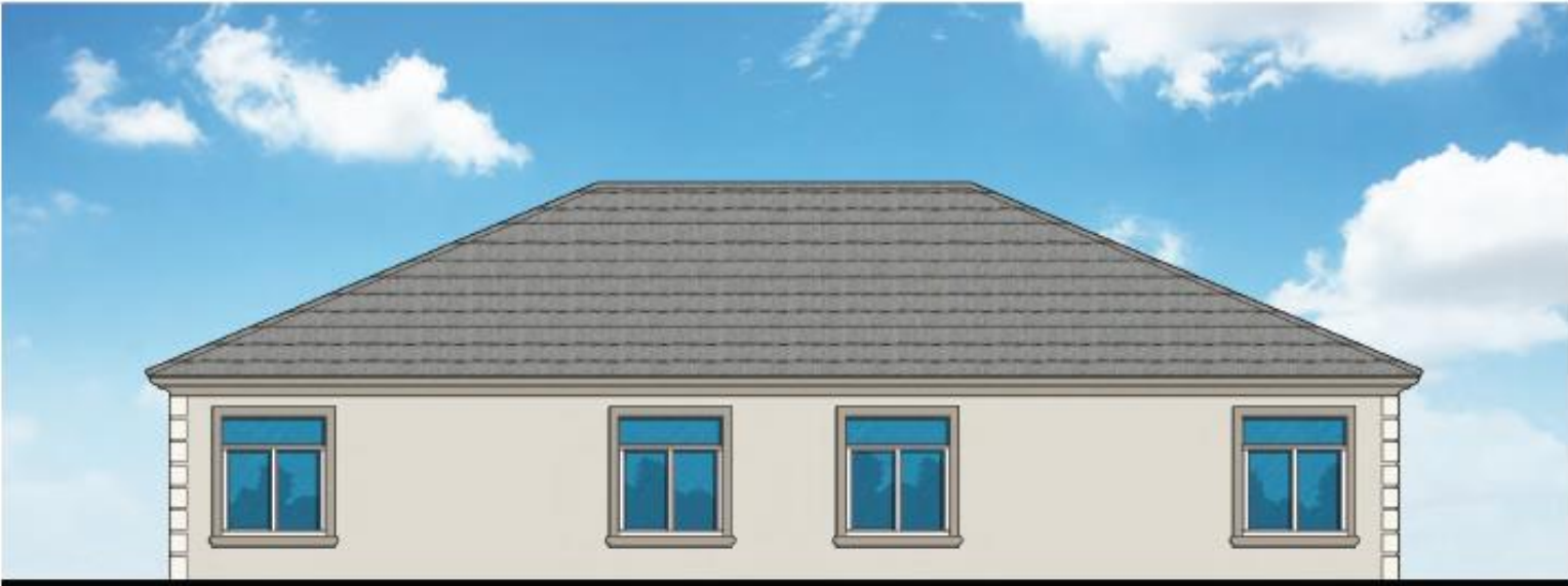
REAR ELEVATION WITHOUT LANDSCAPE