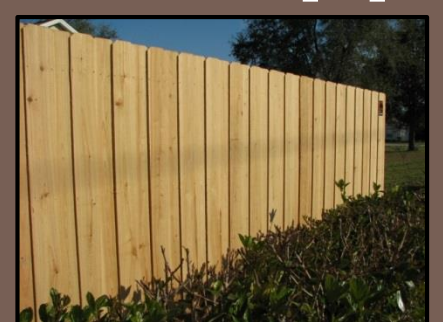
Board on Board