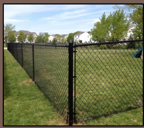
Vinyl Coated Chain Link (Brown, Black or Green)