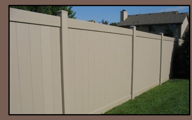
PVC/Vinyl (Beige, Tan, Gray)