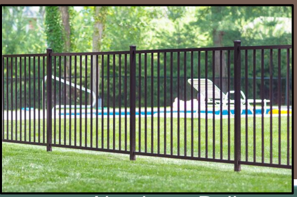
Aluminum Rail (Bronze, Black, White)