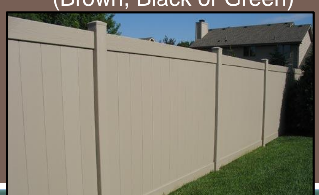
PVC/Vinyl (Beige, Tan, Gray)