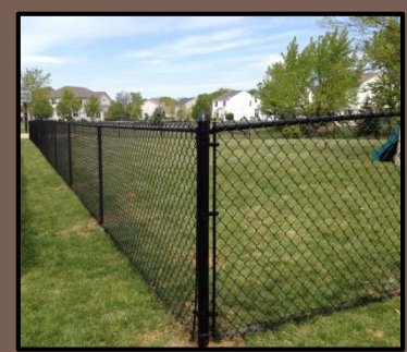
Vinyl Coated Chain Link (Brown, Black or Green)