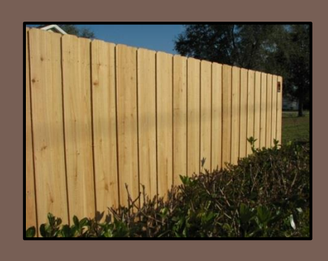
Board on Board