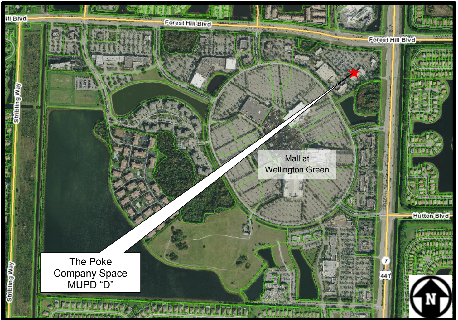
Exhibit "A" Location Map