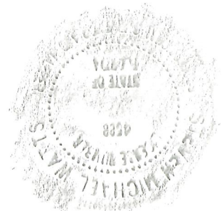
Exhibit C - Surveyors Certificate re No Changes