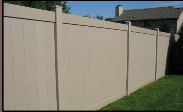
PVC/Vinyl (Beige, Tan, Gray)