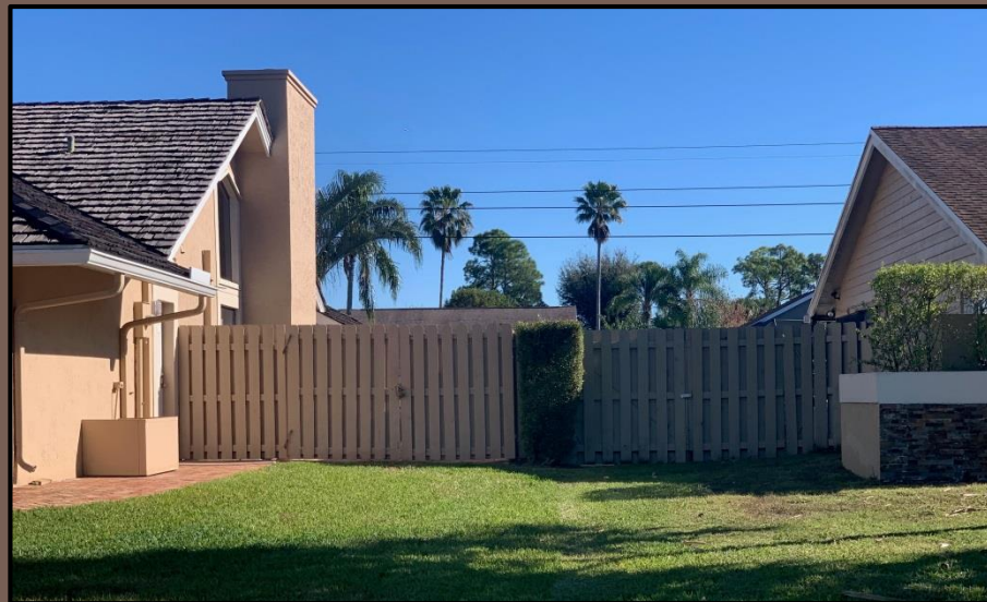
Painted Wood Fences