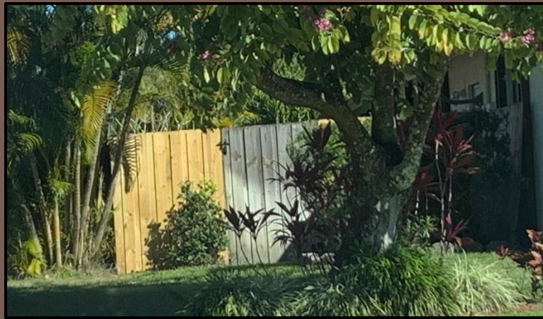
New vs. Old