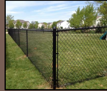
Vinyl Coated Chain Link (Brown, Black or Green)