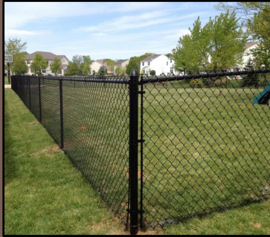
Vinyl Coated Chain Link (Brown, Black or Green)