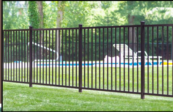
Aluminum Rail (Bronze, Black, White)