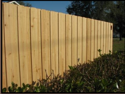
Board on Board