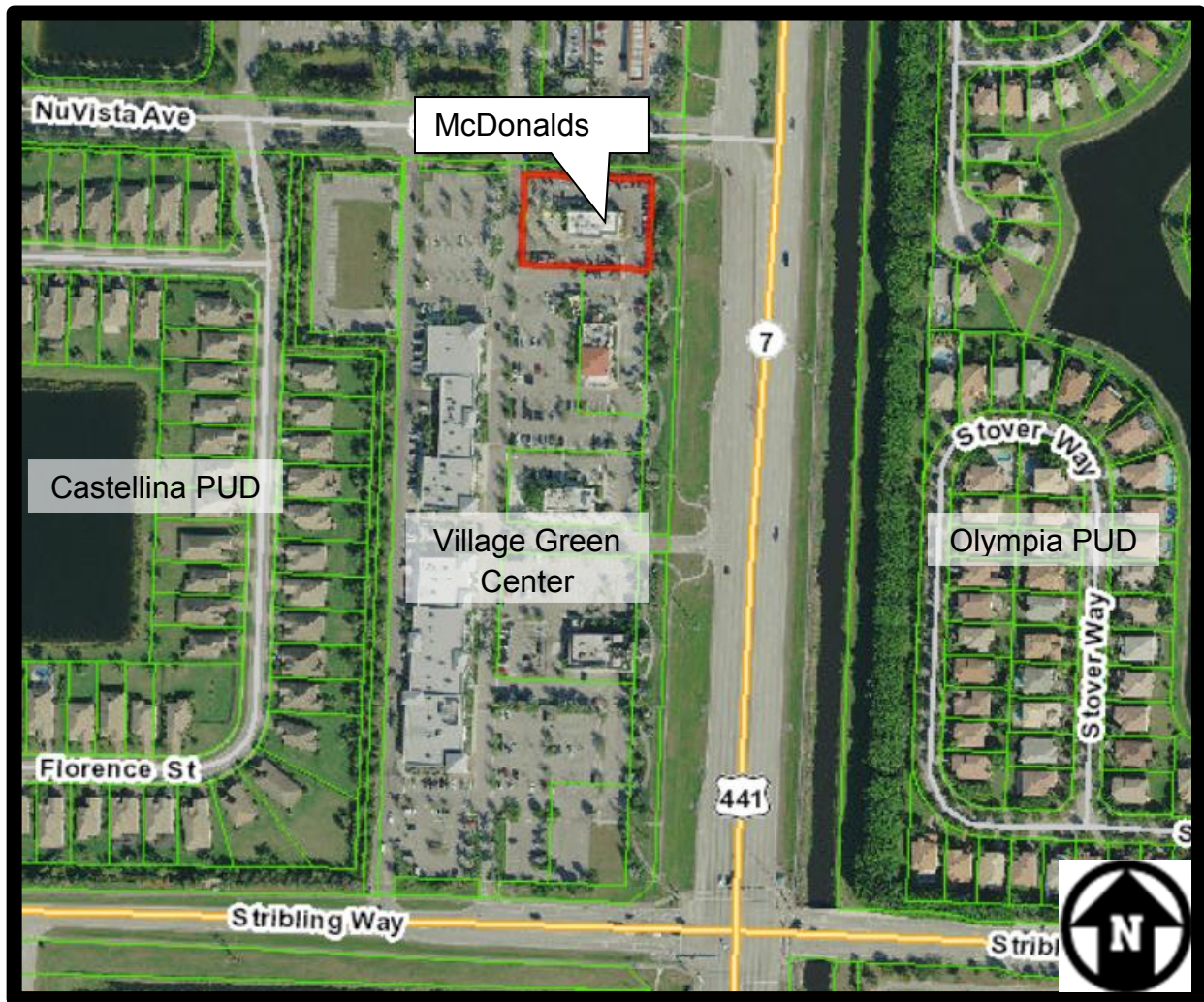
Exhibit "A" Location Map