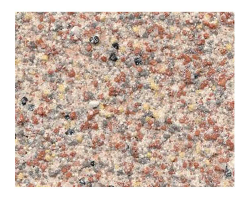
Wall #2: Ameristone by 'Dryvit' #15 River Rock